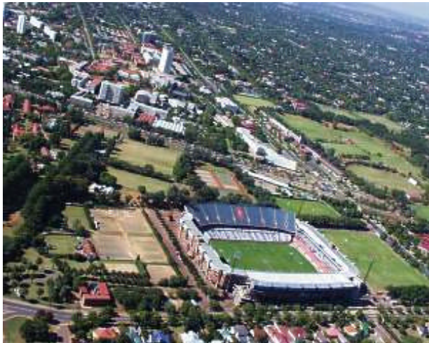
Loftus Versfeld and the University of Pretoria

The campus is ideally situated from a student’s point of view. All the student residences are close to the main campus. The ladies’ residences are within walking distance, while the men’s residences are within a short bicycle ride from the campus and there is a special bus service for male students between their residences and the main campus. Next to the main campus in Burnett Street is the Hatfield Plaza shopping mall. It is within walking distance from the main campus and offers a wide range of shopping facilities, as well