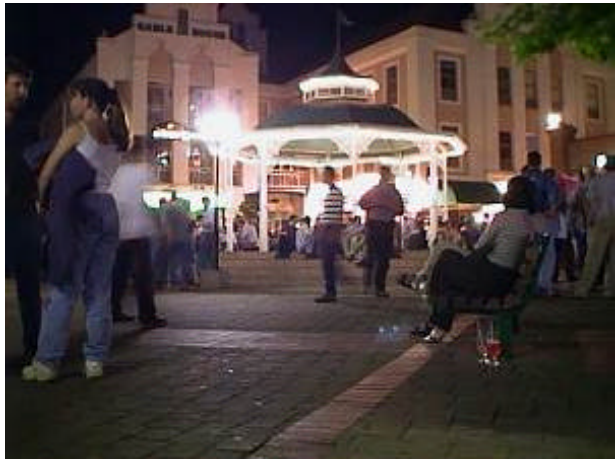
Hatfield Square (opposite Hatfield Plaza).

Along with the noteworthy buildings and those of historical value, the campus also has beautifully laid out gardens with many shrubs and trees, of which the characteristic Jacaranda trees forms an integral part. The Jacaranda trees come into bloom during October and the presence of these trees integrates the campus of the University of Pretoria with the surrounding suburbs of Pretoria. If Pretoria can be called the “Jacaranda City”, then the campus can rightly be called the “Jacaranda Campus” of South Africa.